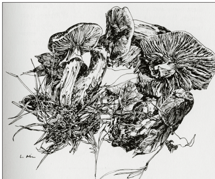
Mushrooms from the forest, Agate Point, Bainbridge Island, 1969.