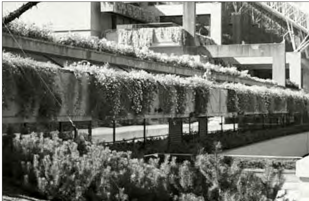
Robson Square demonstrating the integration of plants as part of the building structure.

Oberlander faced obstacles as a landscape architect precisely because she wanted to practice modern landscape architecture. Women were granted access to education in landscape architecture after World War II, just when modern architecture and landscape architecture gained momentum. Yet at the same time the very idea of modern design presented challenges to them in practice. The popular conception of the Modern architect was a male genius who did not rely on history to inform his design work, instead fashioning new styles by violating familiar rules and conventions and making groundbreaking use of technologies and materials newly available after the war. Women were seen as lacking both the requisite spark of genius and the technical training necessary to fill this role. Even the drawings created by modern designers no longer relied on skills obtained in the fine arts, such as painting and drawing. As construction drawings and specifications became increasingly formalized, plan views and sections, which conveyed technical information needed to build a pro-