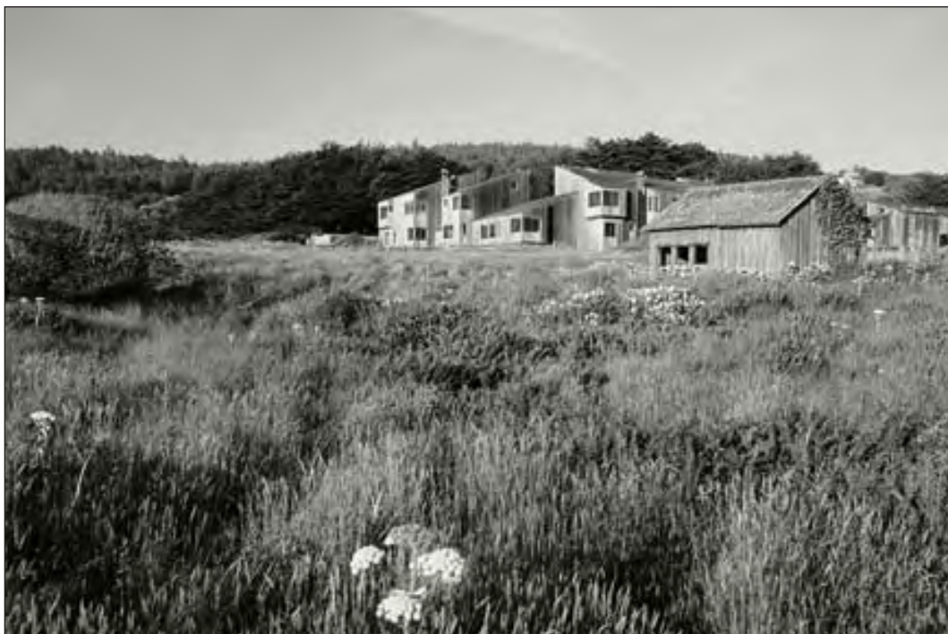
Existing barn and original houses, the Sea Ranch.

Unpublished transcripts of the Look interview, however, tell a more complex story. According to Boeke, the Sea Ranch may have begun “as an emotional response to the land” but it quickly evolved into a complicated financial transaction that