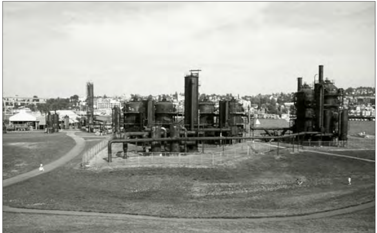
Looking across Gas Works Park from atop the Great Mound, the dips and rises of the landscape clearly evident.