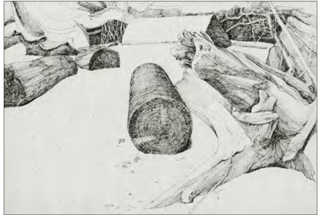
Driftwood on beach, Agate Point, Bainbridge Island, Washington, 1969.

Possibly the most beautiful of all such places in Washington are the sequence of beaches and bays that form the coast just south of Neah Bay at the northern tip of the Olympic Peninsula – a collection of big, rough bays with stacks of rocks and trees standing just offshore; receding cliffs, toppling trees, acres of logs, and piles of driftwood. These will forever be associated with the Native Americans who, for millennia, have lived, fished, and set out to sea after whales from here. Each of