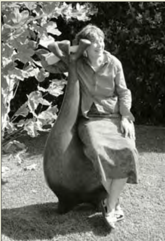
Isabelle Greene.

Undertaken in 1980 by Isabelle Greene, F.A.S.L.A., before she had even obtained her landscape architecture license, this garden is the perfect synthesis of the ecological sensitivity, sustainability, and aesthetic she has been exploring since the early 1960s. Greene uses permeable surfaces; drought-tolerant, often native plantings; foliage color and texture for interest instead of flowers or clipped hedging; and abstract patterns to shape well-proportioned spaces instead of formal design conventions. Many of the colors she chooses or the shapes and stones she plays with allude to California's natural landscape. She grew up in the southern part of the state, studying botany and hiking its sage-covered mountains, rocky arroyos, sparkling deserts, and foggy