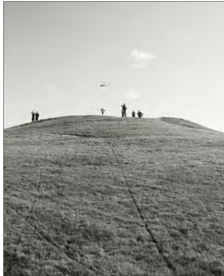
Kites soaring above the Great Mound at Gas Works Park, below them the capped toxic soils.

One enters the first of the garden spaces along what Haag called a Ceremonial Path, the sequence beginning with a garden space adjacent to a Japanese-inspired guest house. Haag’s first move was to enclose the area by expanding several existing mounds of earth left over from another garden project so that they physically although not visually separated the new