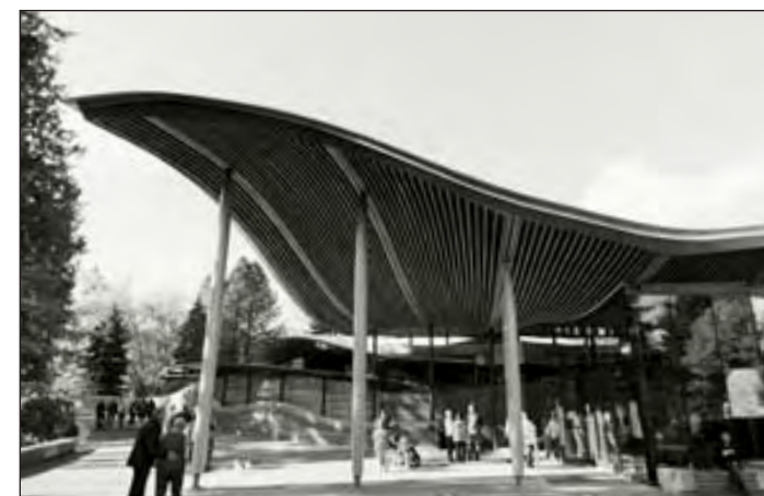
Entrance to the VanDusen Botanical Garden Visitor Centre.