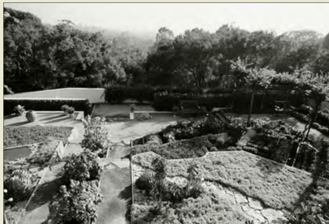
Overview of Valentine garden, Santa Barbara.

This hasn’t stopped the accolades from piling up for her landscape design, which was officially elevated to the status of