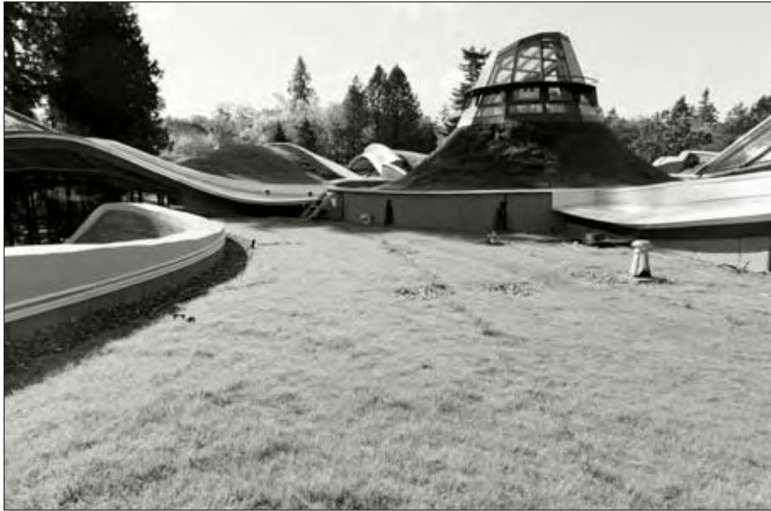
On top of the roof at the VanDusen Botanical Garden Visitor Centre.