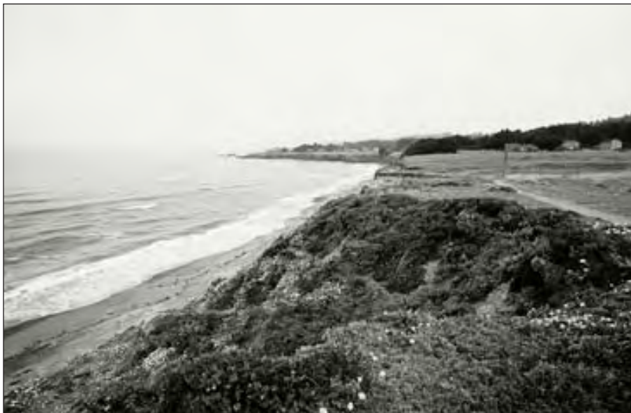
Coastline, the Sea Ranch.